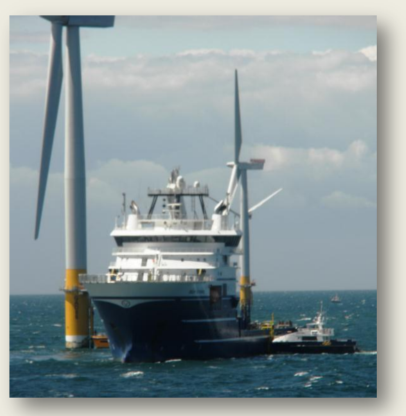
Deep Cygnus performing trenching and cable burial operations at the Greater Gabbard Offshore Wind Farm in the North Sea