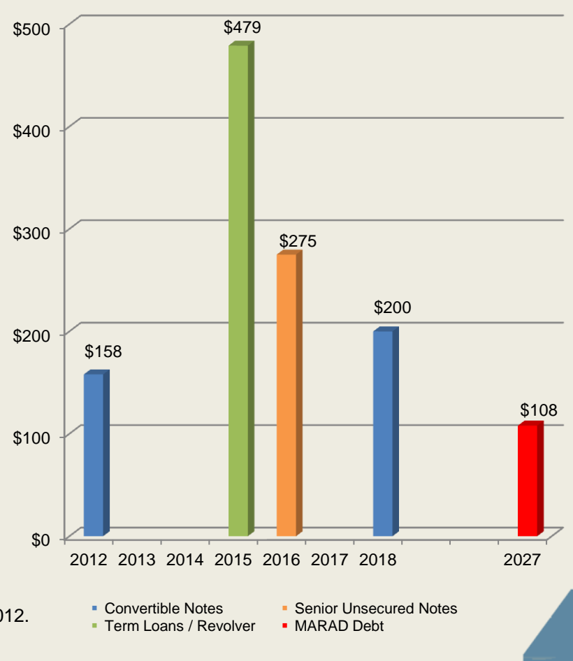
Maturity Profile $ amounts in millions