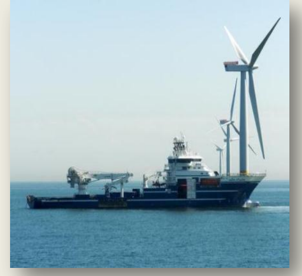
Chartered vessels such as the Deep Cygnus are being utilized to support the growing alternative energy industry in the North Sea.

The state of the art iTrencher system trenches, lays pipe up to 16" in diameter, and backfills in a single operation.