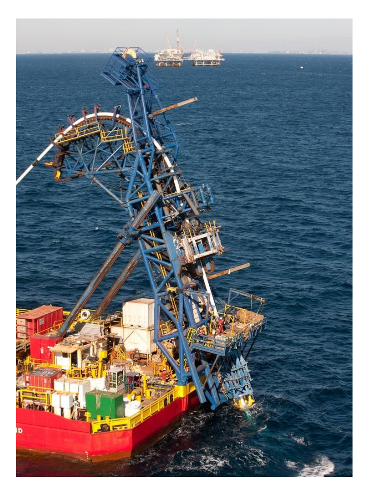
Intrepid performed pipelay and saturation diving operations off the California coast during the fourth quarter.