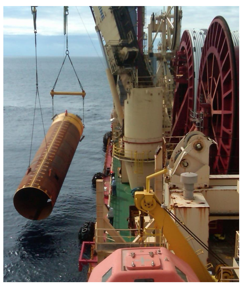
Express installing suction piles in the Walker Ridge block of the Gulf of Mexico