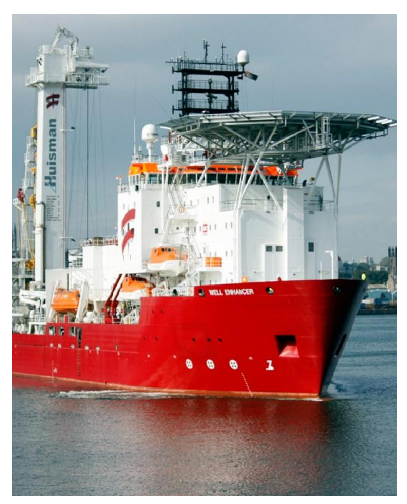
Well Enhancer, operating in the North Sea, is the world's only monohull well intervention vessel capable of deploying coiled tubing