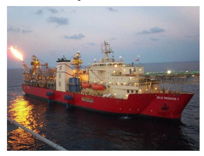
Helix Producer I deployed on Helix's Phoenix field in Green Canyon 237 (Gulf of Mexico)