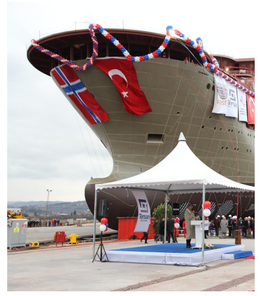
Grand Canyon being prepared for transit from Turkey to Norway for completion and mid-2Q12 delivery.